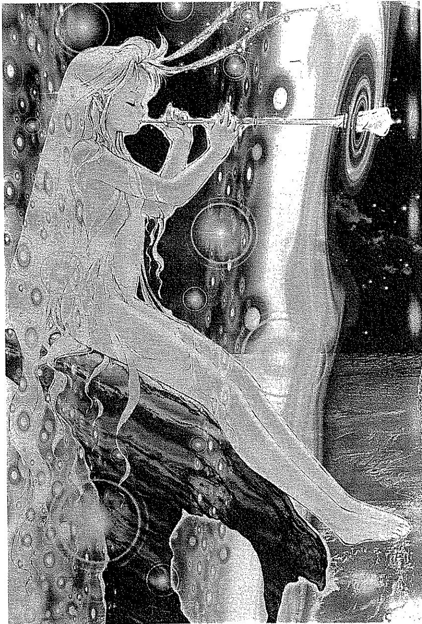
Figure 6.1 Cute and free in fantasy land. Illustration courtesy of Tsuzuki Katō at Kadokawa Shoten

used, widely loved, habitual word in modern living Japanese' (CREA, November 1992: p.58). Iwashita, president of the Kikan Fanshii (Fancy Goods Periodical) trade journal, recalls that, 'Rather than being another postwar value, the present meaning of kawaii has not been in existence for any longer than fifteen years' (Shimamura 1990:225). The term kawaii appears in dictionaries printed in the Taishō to 1945 period as kawayushi . In dictionaries printed after the war until around 1970 kawayushi changed into kawayui , but the meaning of the word remained the same. Kawaii is a derivation of a term whose principle meaning was