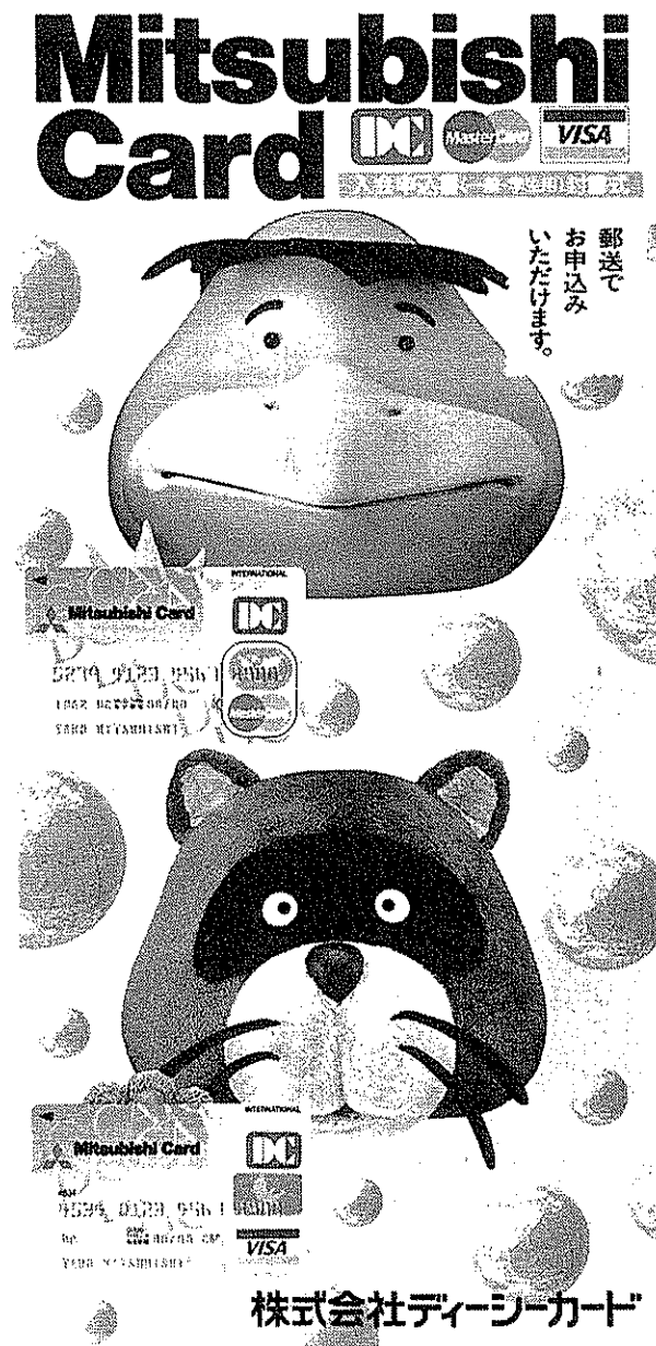
Figure 6.3 Mitsubishi Bank credit card advertisement

lifelessness and slogans etched onto the actual good or printed on the packaging put across more forcibly the same notion of light fun. Cute slogans were more often written in fractured English or pseudo-French than in Japanese. A toilet bowl called petit etoile ; a pink toaster in the shape of a cottage called My Sweet Bread Toaster ; a can opener which says: This can-opener is not just a kitchen tool. Treat it kindly and it will be our loyal friend ; school note paper inscribed with the message: OK! You're in my team. Let's have fun together! ; and a set of plates saying: Life is sweet like a poem when you are with kind friends.