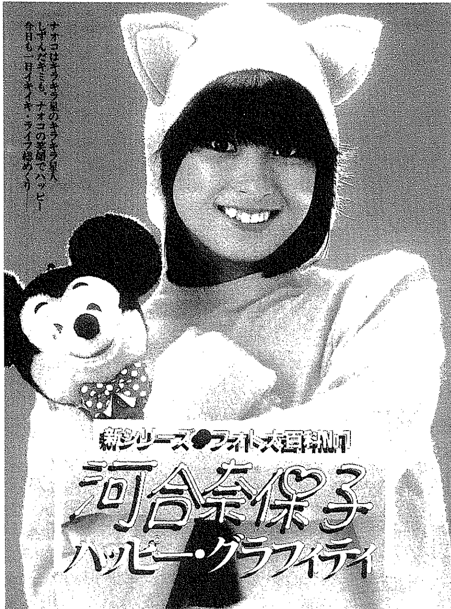
Figure 6.4 Pop-idol Kawai Sonoko in a little doggy outfit

sub-culture oriented magazine Takarajima through the 1980s; in Cutie the rebellious, individualistic, freedom-seeking attitude embodied in acting childlike and pursuing cute fashion is very clear. The magazine prints pages of photographs of readers, whom it calls 'kids', posing in clubs and streets trying to look bad and cute at the same time.